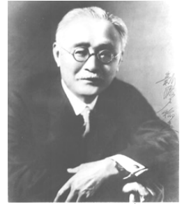
Dr. Inazo Nitobe

Over a century has passed since he wrote this thesis, but in Japan, it is now more and more thought of as a textbook to restore our original identity, since we seem to be too Europeanized or Americanized. Many foreigners who are eagerly practicing Budo are earnestly reading it as a 'bible' of martial arts, making their spiritual backbone. Both are very advantageous usages.